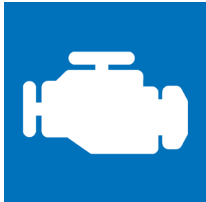
Car Scanner ELM OBD2 (iOS & Android; mostly free)

A vehicle performance / trip computer / diagnostics tool that uses an OBD II adapter to connect to your OBD2 engine management / ECU. It includes a lot of connection profiles that gives you some extra features for many vehicles. See what your car is doing in realtime, get OBD fault codes, car performance, sensor data and more!