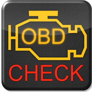
Torque Lite/ Pro (Android only, pro version is paid)

Popular vehicle performance, sensors and diagnostics tool.