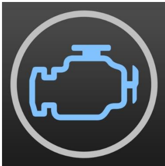
OBDFusion (iOS & Android, paid)

Please go to Settings – OBD2 Adapter Settings, select Bluetooth as Connection type, then select VEEPEAK as the Bluetooth device. Close the App and re-start it.